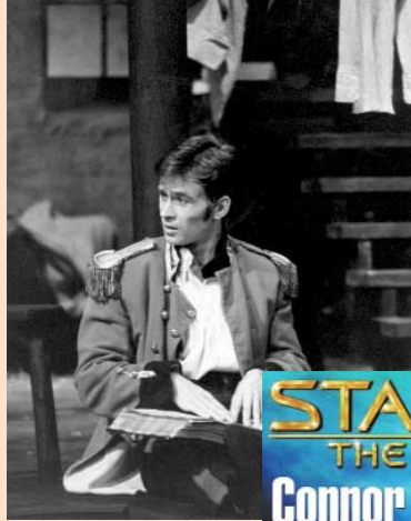
Trinneer, performing in uniform at UMKC, and as Commander Tripp Tucker.